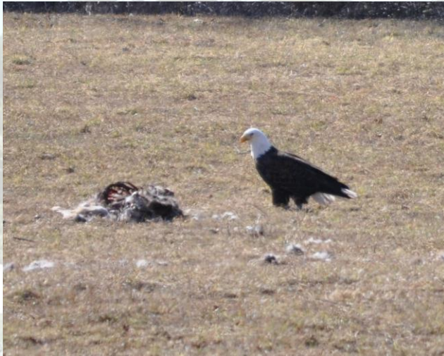
An Eagle enjoys a snack near the airport.